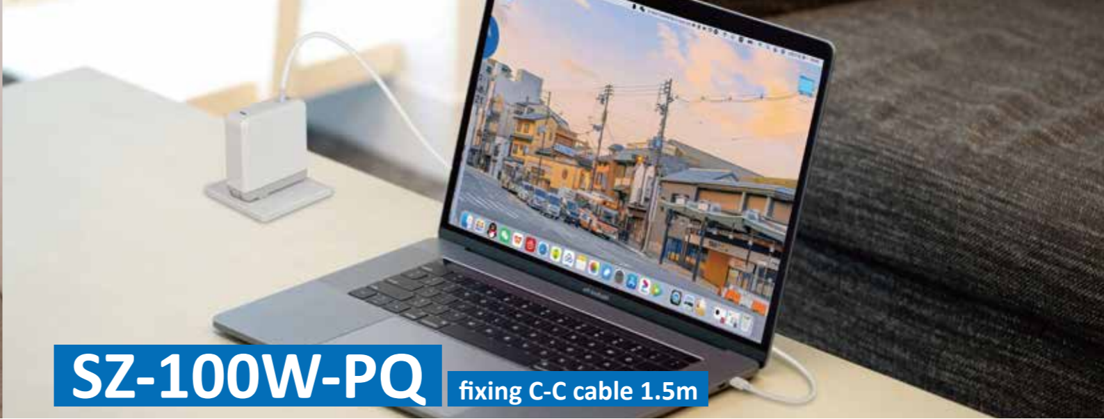
SZ-100W-PQ fixing C-C cable 1.5m